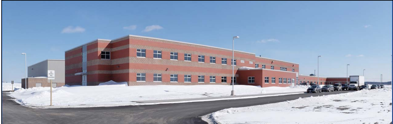
Figure 1: Hartland Community School, 2007 March 8

The New Brunswick Department of Supply and Services (NB DSS) embraced this research initiative during the construction of the Hartland Community School – a 95,000 square foot state-of-the-art school designed to accommodate approximately 700 students from Kindergarten to Grade 12 in rural Hartland, New Brunswick, see Figure 1. NB DSS is the government body responsible for delivery of provincial construction projects; as such they manage the services of both consultants and contractors. NB DSS recognized that this technology had potential to monitor construction progress remotely, to promote the project to the public, and to provide a permanent record for such purposes as approving progress payments.