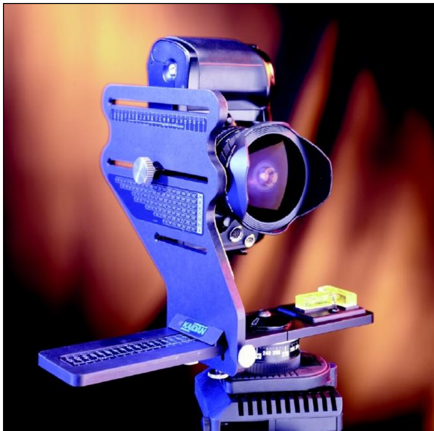
Figure 2: Kaidan Kiwi-L Panoramic Tripod Head (Kaidan)

There are various technologies necessary to capture images, stitch them together, and convert the stitched image into a virtual reality panorama. Since, the scope of this paper does not permit a description of these technologies, we recommend the following references to the reader for an understanding of the required hardware and software: Panoramas.dk (2007), Virtual Parks (2007), and World Server (2007). A photograph of the type of panoramic head used for this research is shown in Figure 2.