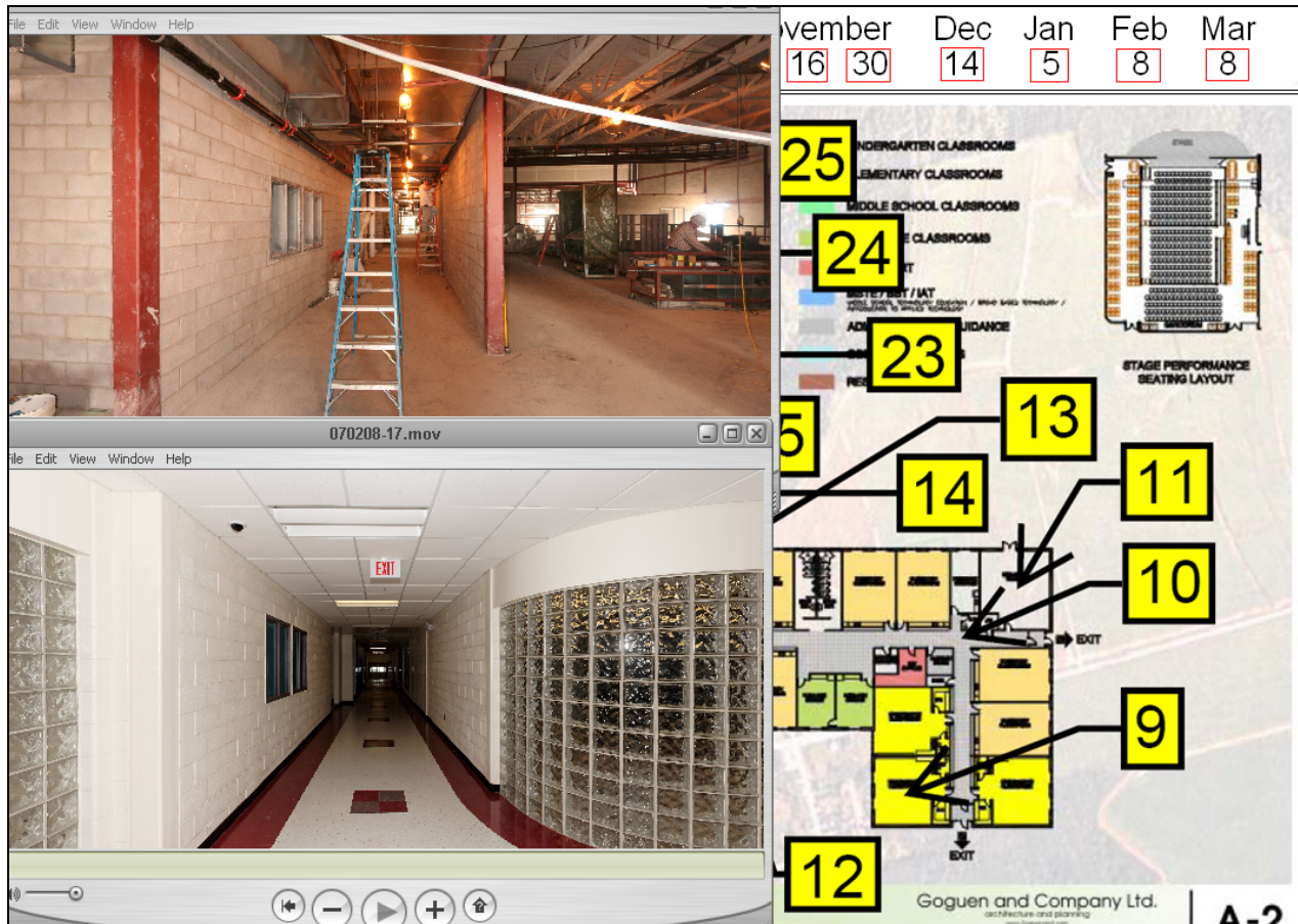
Figure 4: User Interface: Level 1